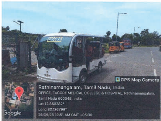
Battery car for transport of patients within the campus