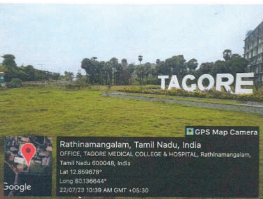
Tagore Medical College – front landscaping