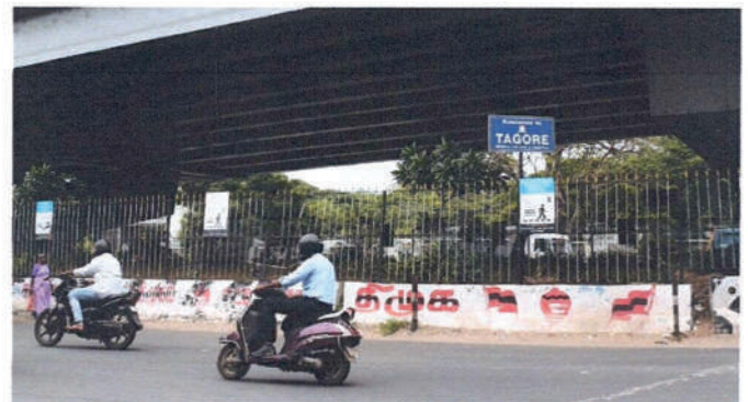
Green zone maintained by Tagore Medical College at Vandalur Junction