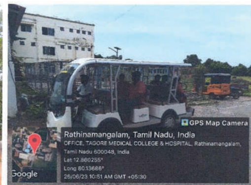
Battery cars for plying within the campus