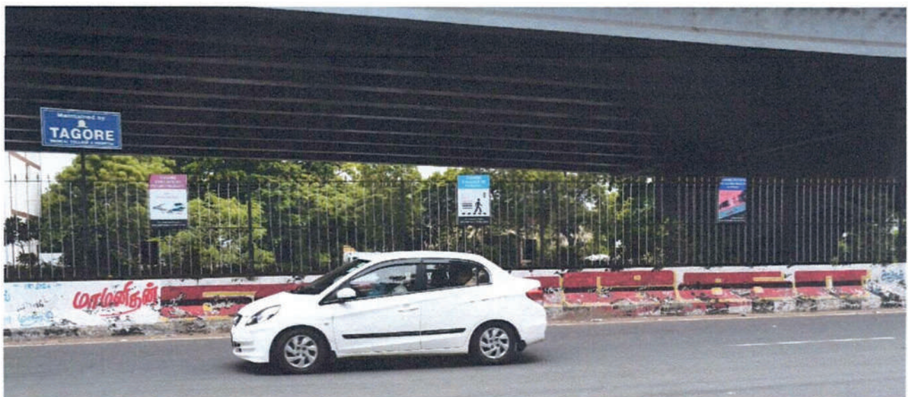
Green zone maintained by Tagore Medical College at Vandalur Junction