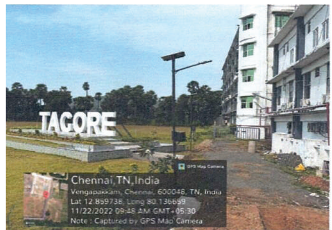
LED Lighting using Solar panel