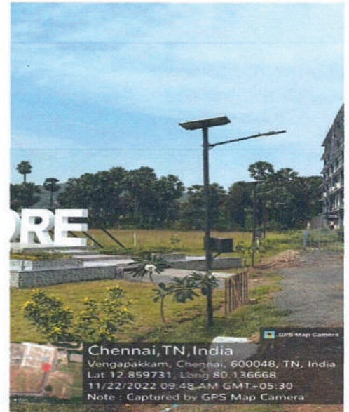
Lighting using Solar panels