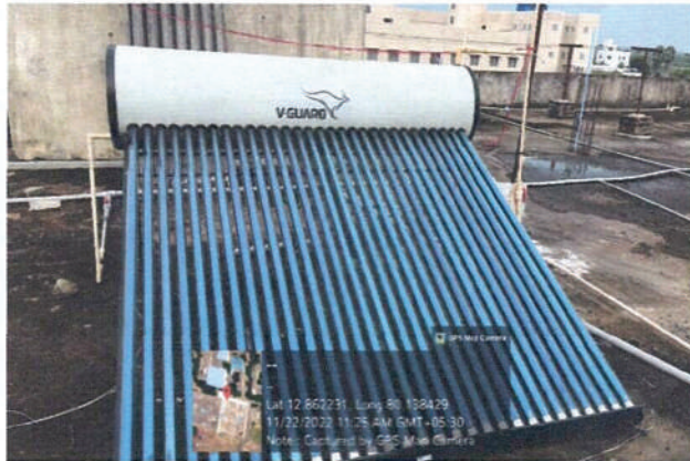
Solar Panels for energy conservation