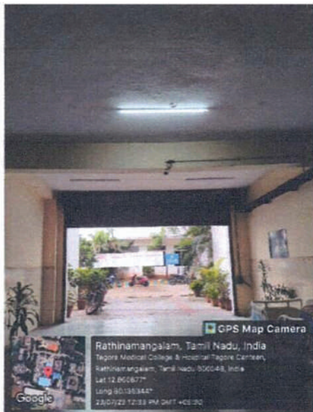
Sensor based lighting for power conservation