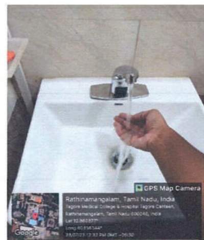
Sensor based tap at girls common room for energy conservation

Immanuel DEAN TAGORE MEDICAL COLLEGE & HOSPITAL RATHINAMANGALAM, MELAKOTTAIYUR POST, CHENNAI-600 127.