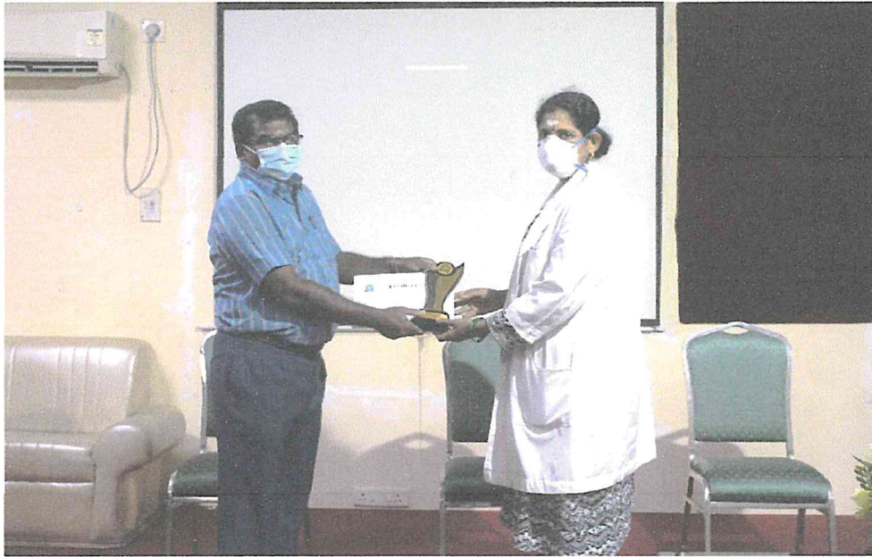
Presentation of certificate and memento

(Affiliated to the Tamil Nadu Dr.MGR Medical University & Recognized by the Ministry of Health & Family welfare, Govt. of India New Delhi)