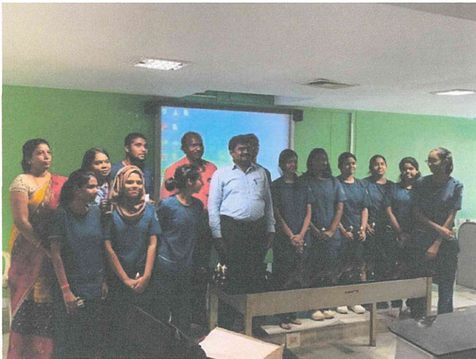
Group photo with the prize winners

Signature DEAN TAGORE MEDICAL COLLEGE & HOSPITAL RATHINAMANGALAM, MELAKKOTTAIYUR POST, CHENNAI - 600 127.