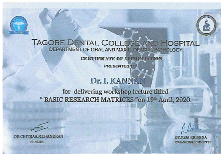
Certificate of appreciation