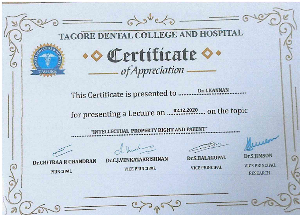
Certificate of appreciation

Imman DEAN TAGORE MEDICAL COLLEGE & HOSPITAL RATHINAMANGALAM, MELAKOTTAIYUR POST, Chennai-600 127.