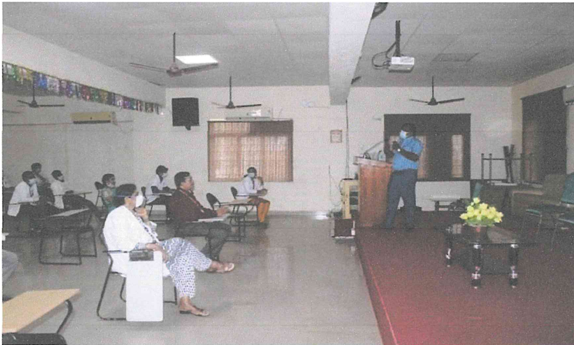
Presentation of Guest lecture with social distancing

The lecture presentation focused on the concepts of patenting and the ways in which one can safeguard his/her work from being stolen. He gave a clear picture about the various method of application of national and international patents. There were 51 participants in the program. Overall the program was very interactive and informative.