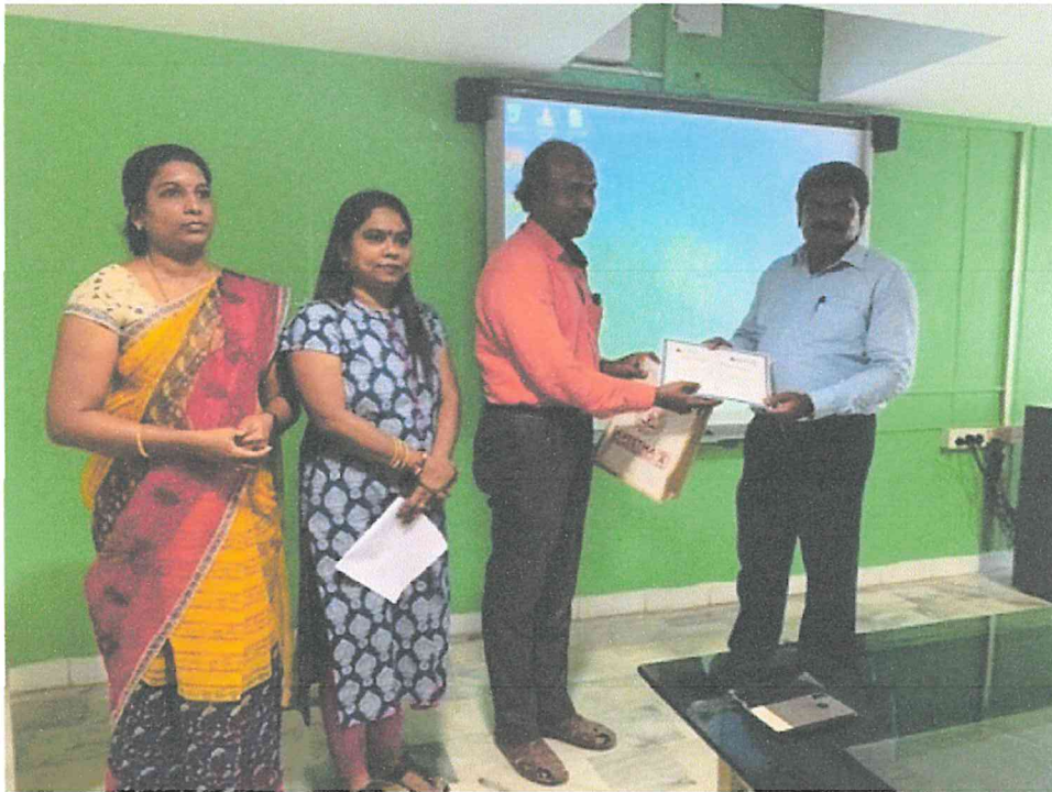
Presentation of certificate and memento

(Affiliated to the Tamil Nadu Dr.MGR Medical University & Recognized by the Ministry of Health & Family welfare, Govt. of India New Delhi)