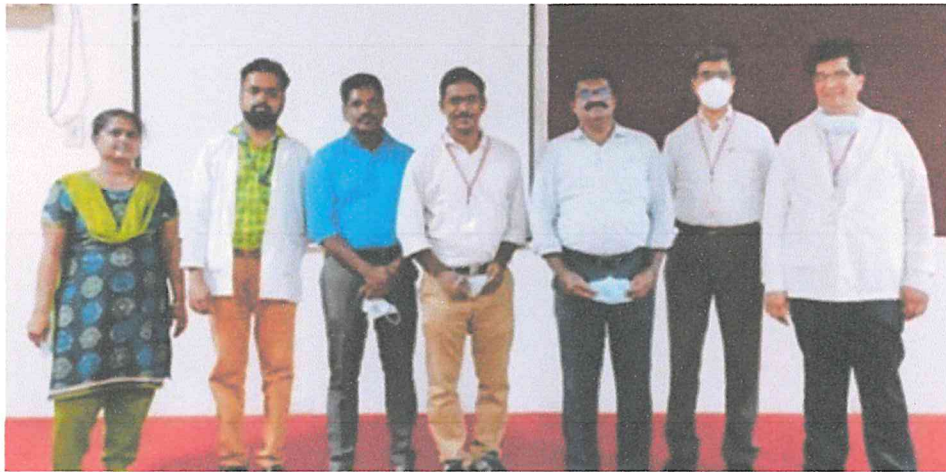
Group photo with the organising committee