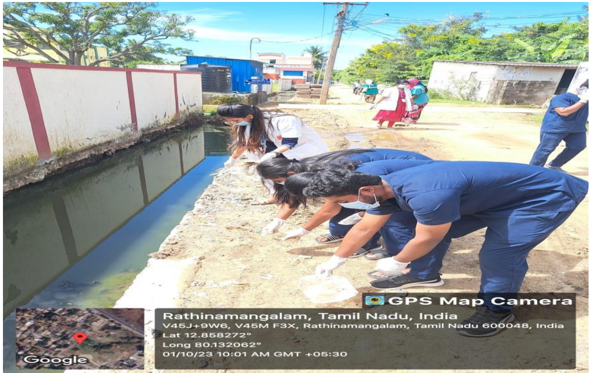
3. Residential areas in Rathinamangalam Village