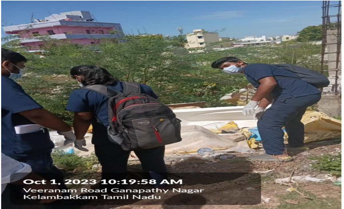
1. Residential areas in Kelambakkam Village