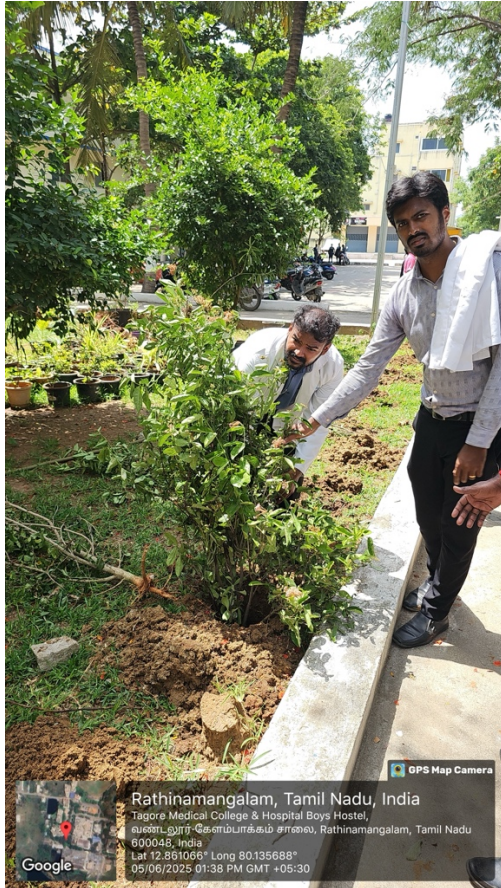
Tree Plantation Drive: World Environment Day 2025 05.06.2025