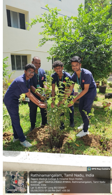
Tree Plantation Drive: World Environment Day 2025 05.06.2025