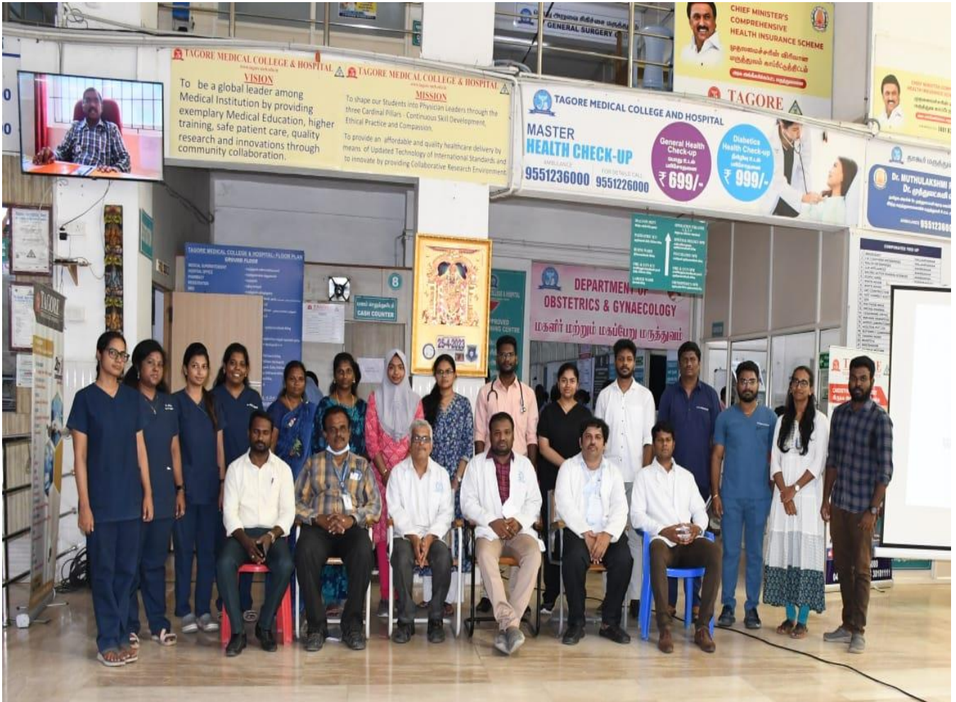
The Role Play was Organized by the Department Of Community Medicine